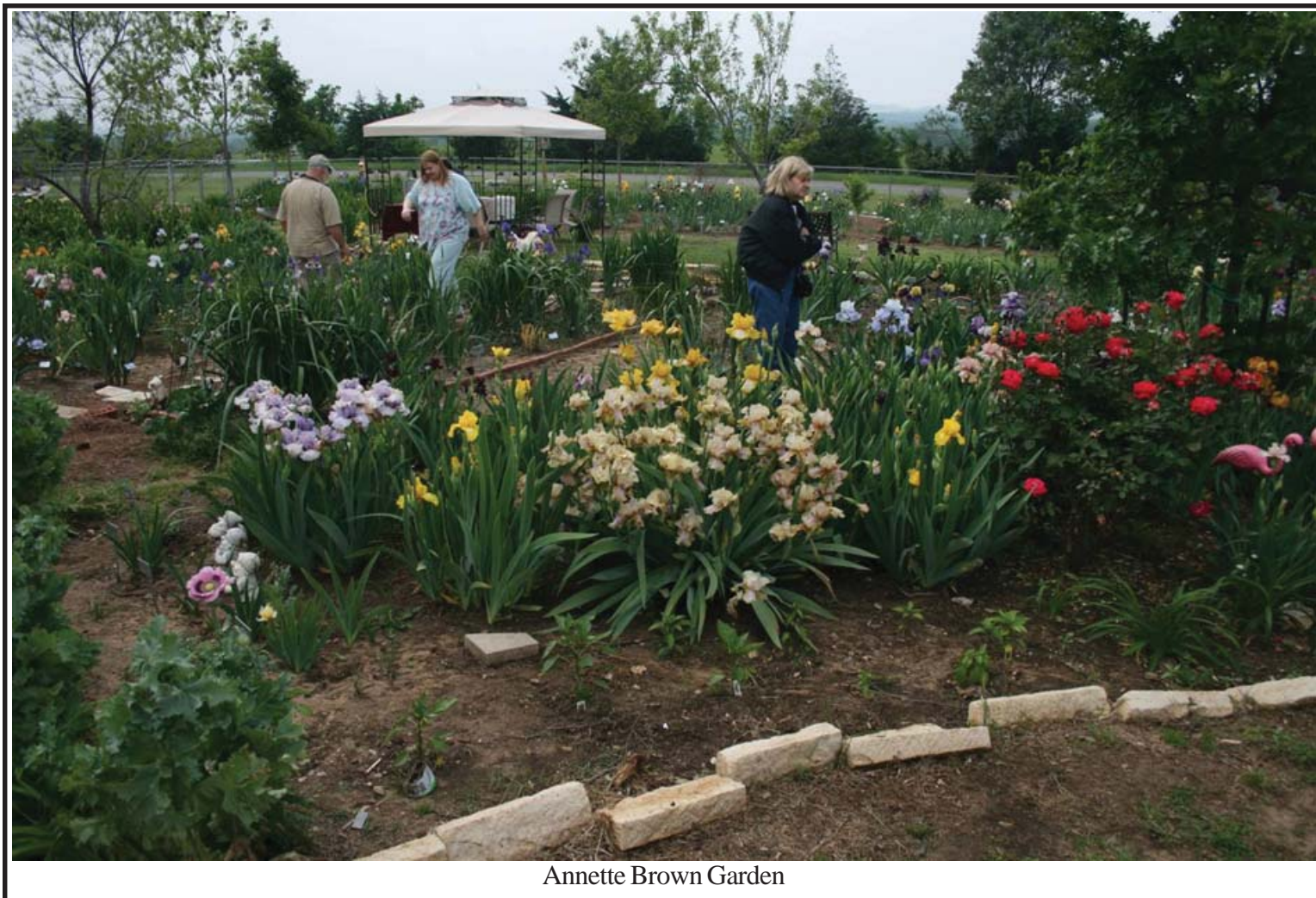
Annette Brown Garden